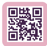
School Group Travel