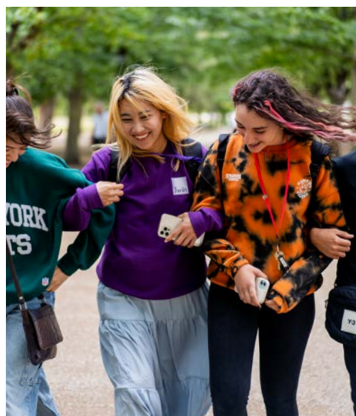
Walking tour 3