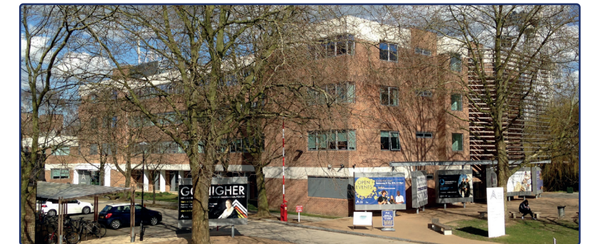
Our campus at City of Oxford College

At break times students have access to the café, Wi-Fi, and lovely seating areas on the grass beside the mill stream.