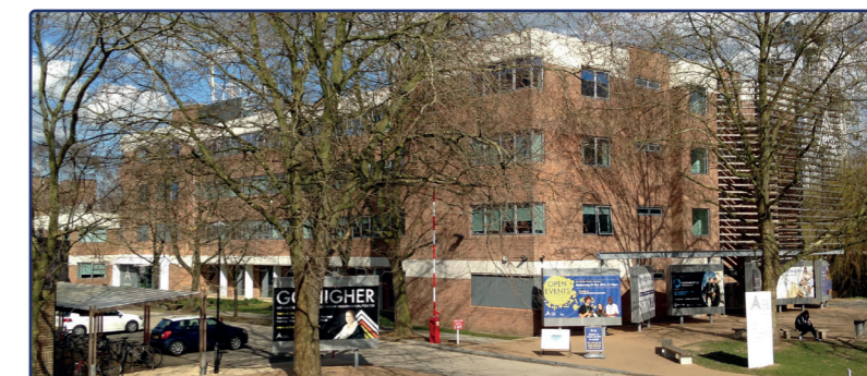
Our campus at City of Oxford College

At break times students have access to the café, Wi-Fi, and lovely seating areas on the grass beside the mill stream.