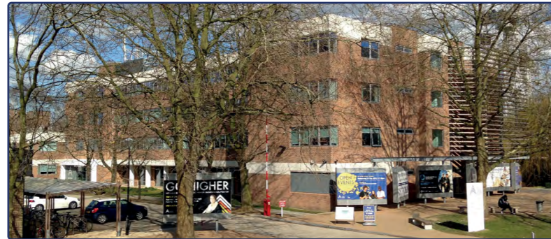
Our campus at City of Oxford College

At break times students have access to the café, Wi-Fi, and lovely seating areas on the grass beside the mill stream.