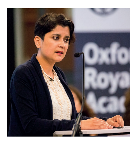
Guest Speakers Successful and famous quest speakers offer students the chance to pose their most important questions.