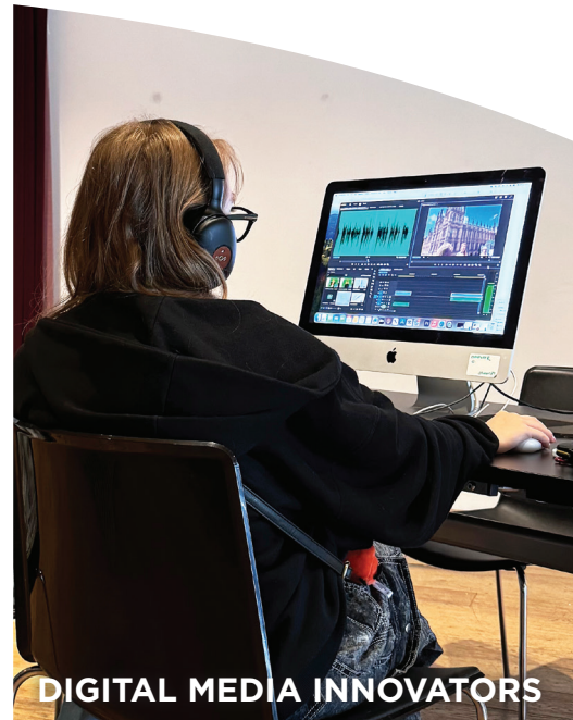
DIGITAL MEDIA INNOVATORS