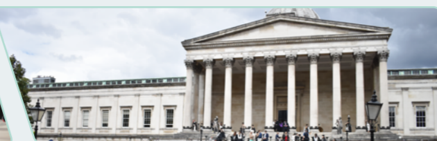
Experience life on campus at a top UK university & explore London