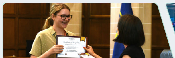
Receive a certificate & industry reference letter to boost applications