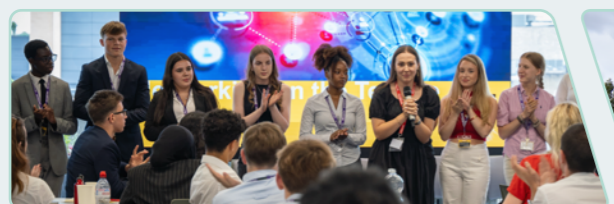
Meet like-minded students from all around the world