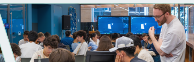
Achieve UCAS points, by having your work assessed to receive our exclusive Level 3 Award in Work Experience

For advanced EFL students, enhance your oral and written skills in business-level English!