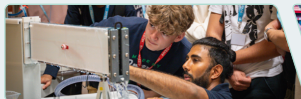
Gain hands-on experience with top professionals