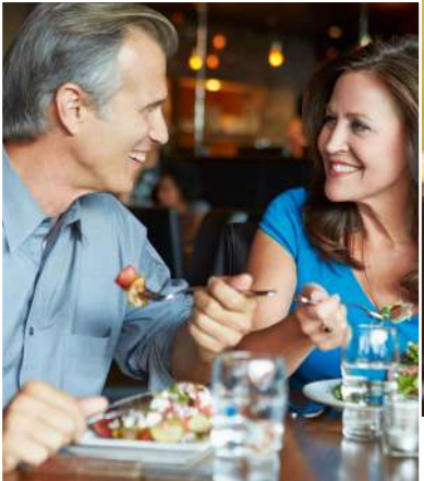
Max 4, Max 1, English and Golf, Discover Devon and Language Holidays for Adults all include networking lunches

SAMPLE TIMETABLE: ihtorquay.uk/courses/english-for-the-over-30s