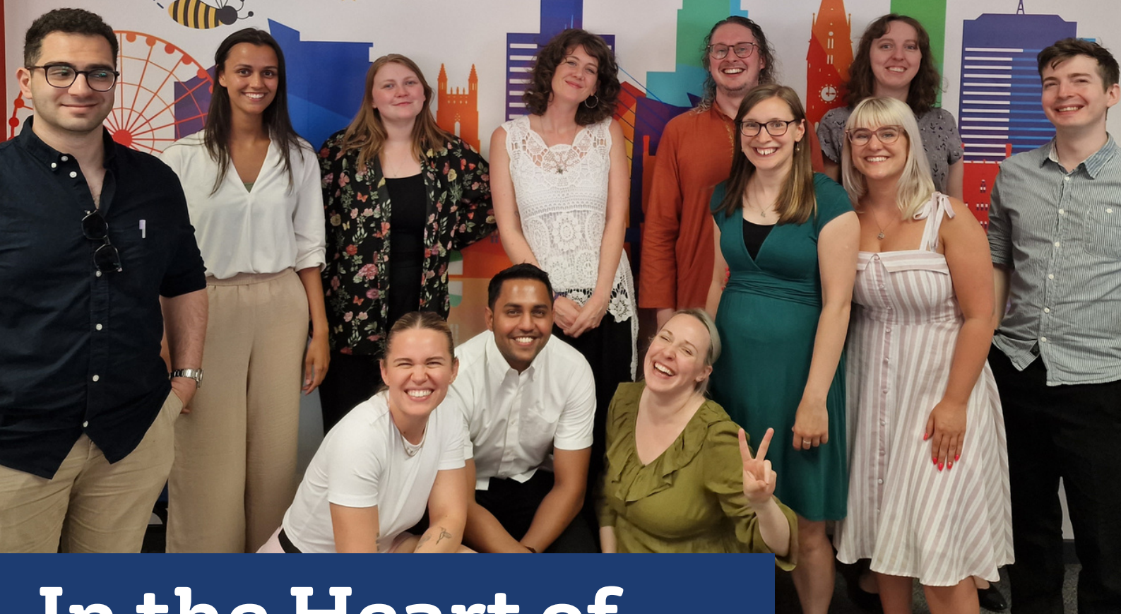
IH Manchester staff