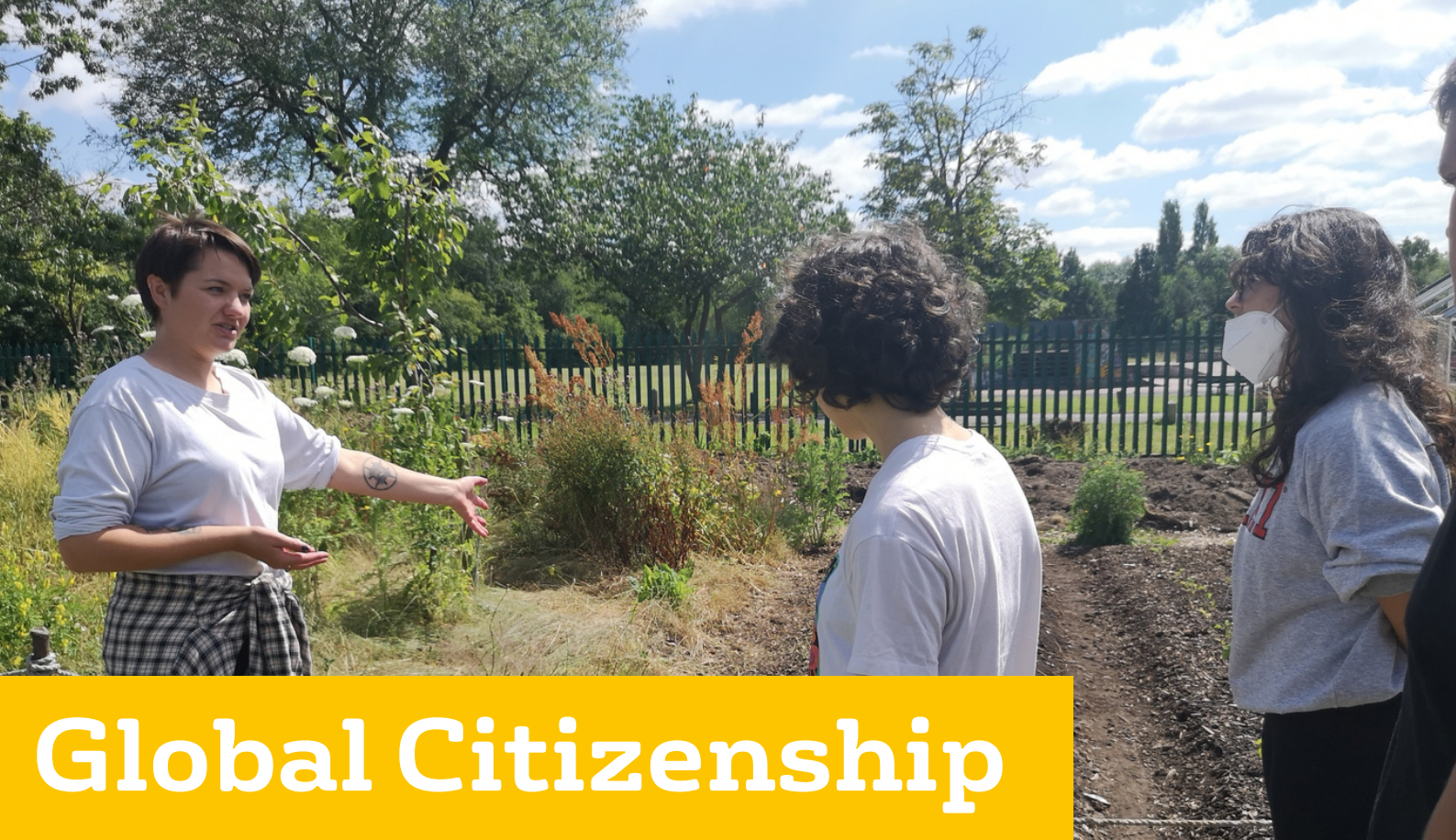
IH Manchester students