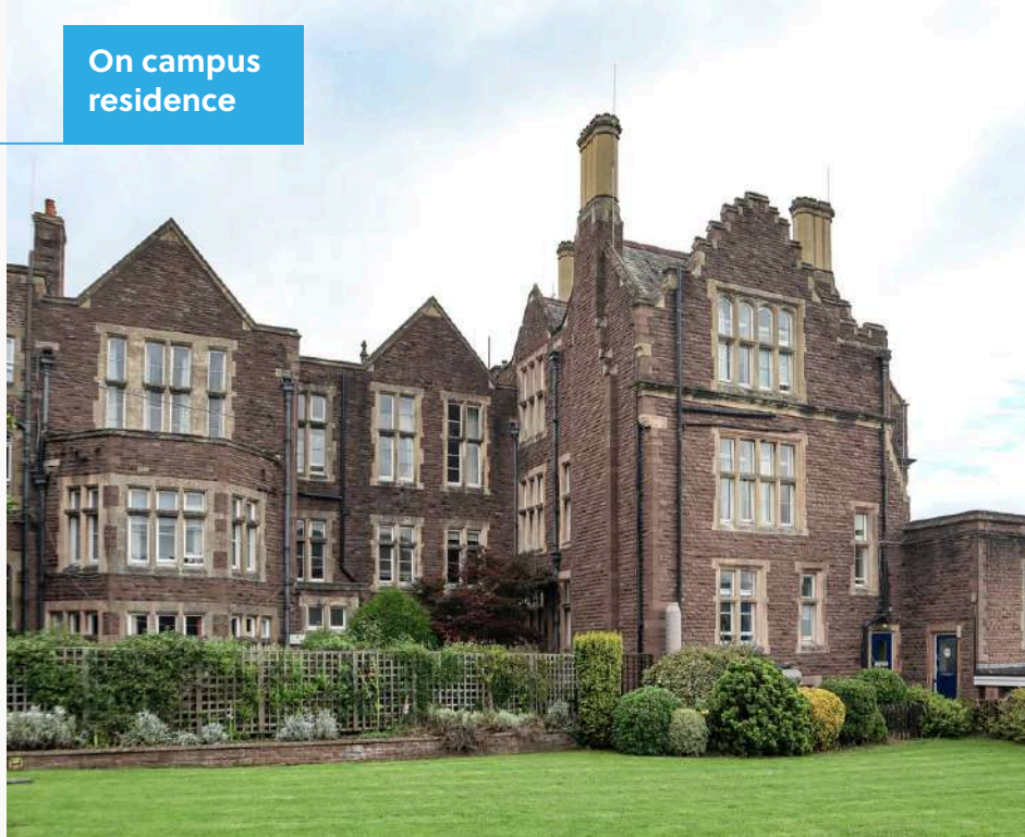
On campus residence