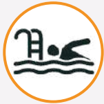
Leisure & sports