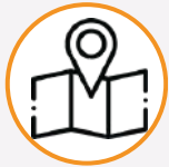
Activities and excursions