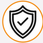
24/7 on site security