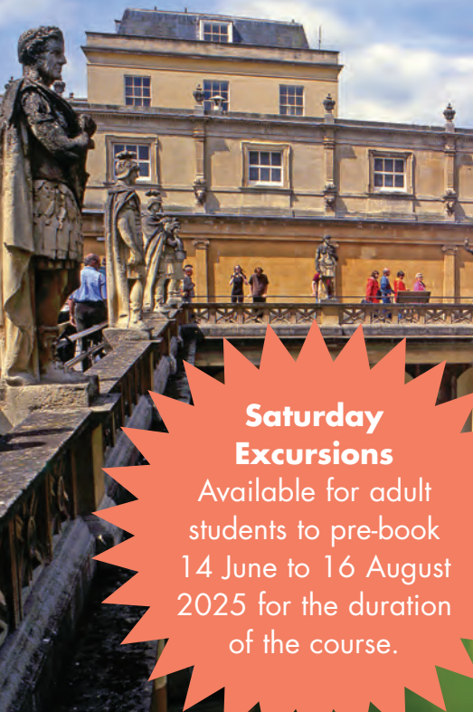
The Roman City of Bath