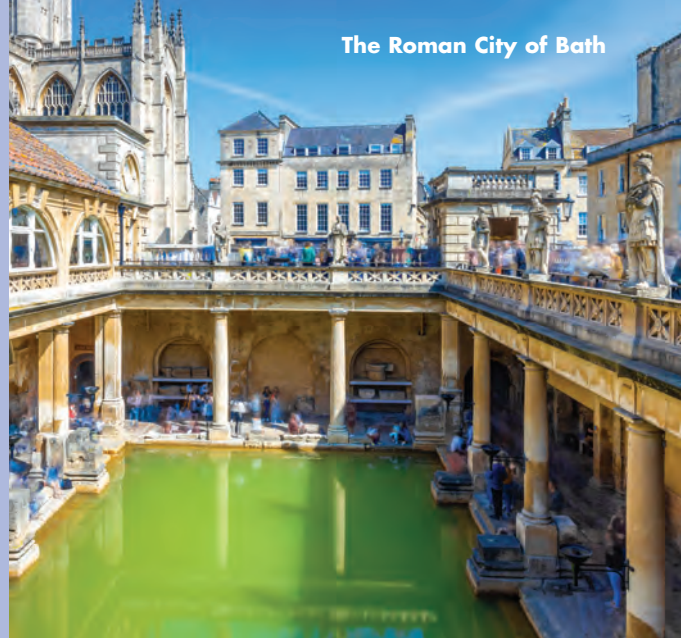
The Roman City of Bath