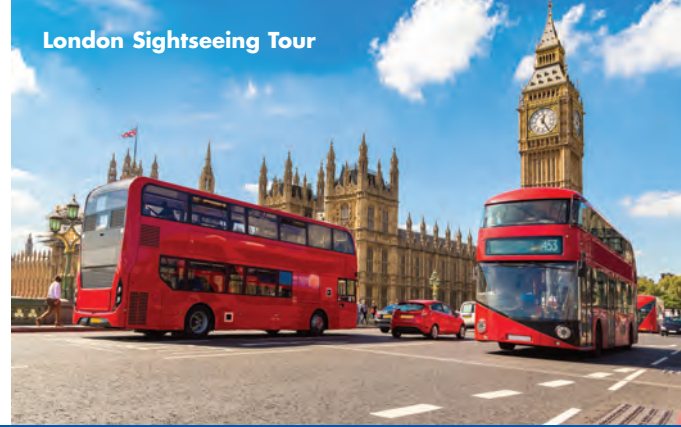
London Sightseeing Tour

All entrance fees are included in the course fees