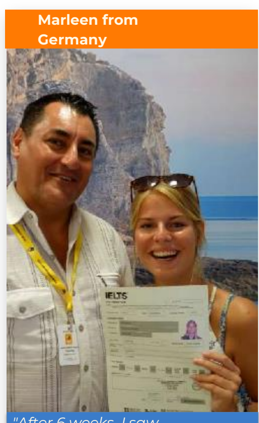
"After 6 weeks, I saw a massive improvement in my English. I was hoping for a score of 6, but to my surprise I got a 7!"